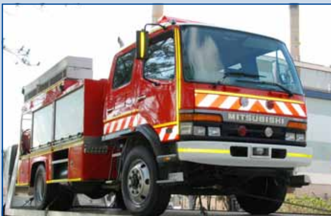
The new fire truck arrives at the power station.

“With up-to-date features like pump and roll available on the truck, it really improves our fire fighting capability,” Andrew said.