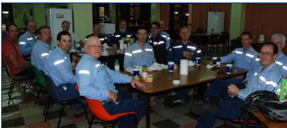
Employees enjoy a hearty breakfast on Bike-n-Brekky Day.

The Ride to Work promotion is an annual national event which encourages employees to feel good and have fun by riding to work.