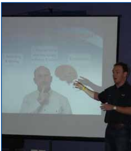
NRG will be running a Zip for Partners Program in October.

NRG and Sentis are pleased to announce a ZIP for Partners Program on Monday 24 October 2011.